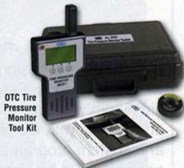
OTC Tire Pressure Monitor Tool Kit