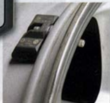
Typical TPM valve stem sensor