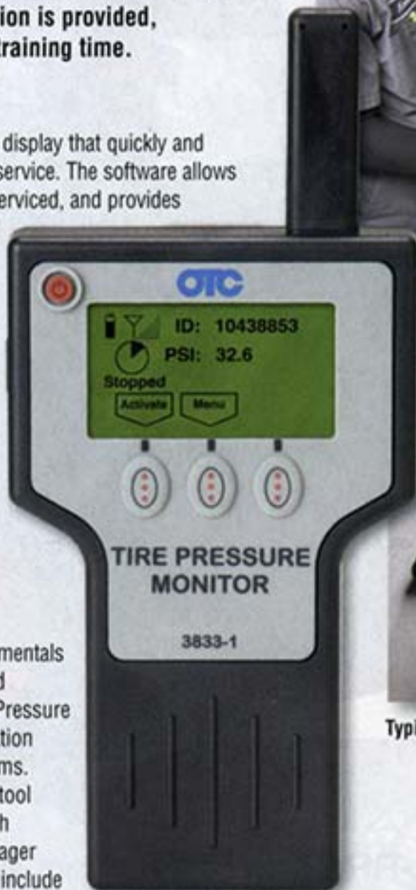
OTC Tire Pressure Monitor Tool

The OTC Tire Pressure Monitor tool lets technicians quickly pre-check sensors before removing the tire for service.